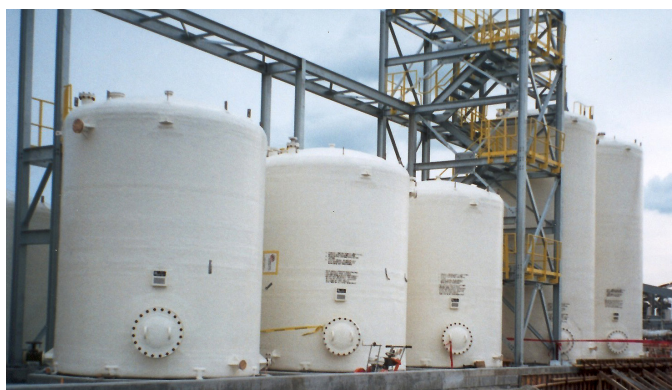
PP-lined phosphoric acid storage tanks