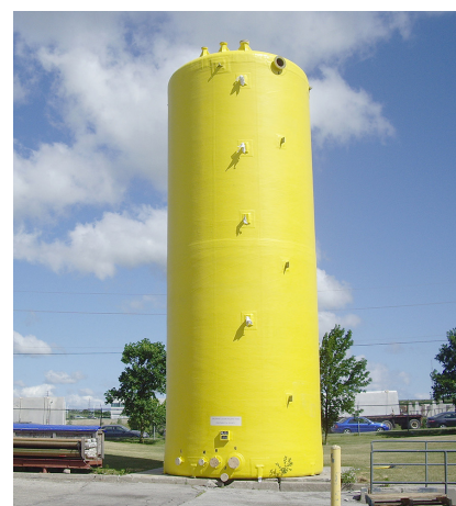
FRP chlorate tank