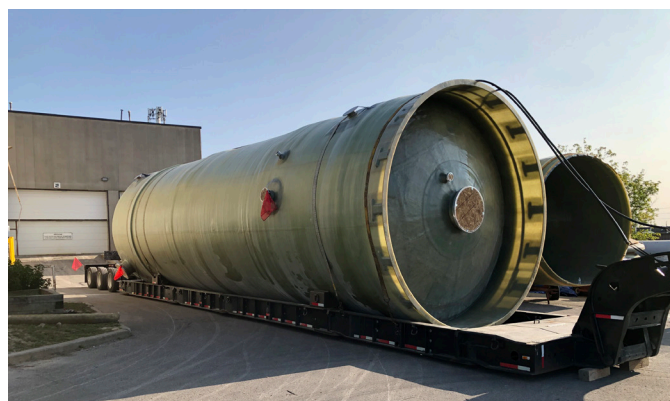
CPVC-lined chlorine drying tower