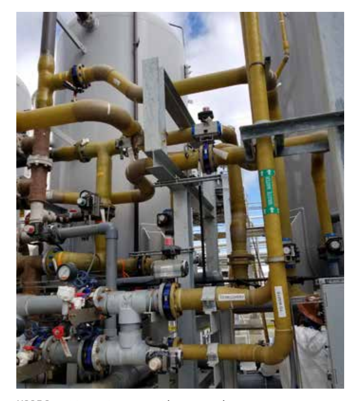
HPPE P-150 in service at an acid recovery plant.

For recommendations on accommodating thermal expansion, refer to RPS Design Manual . For information on conducting a pipe stress analysis of P-150 piping, refer to RPS Doc. No. E--433 , available from our Engineering Department.