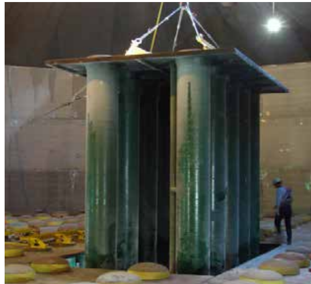
🕒 Gas Risers