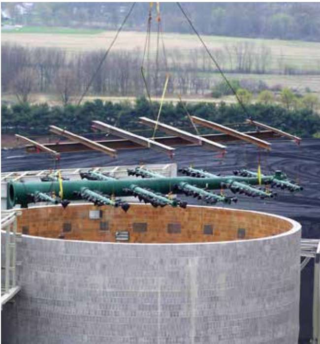
🕒 Flying Absorber - Recycle Header