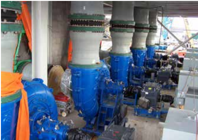
🕒 Recycle Pipe