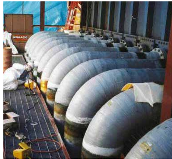
🕒 RLCS Replacement