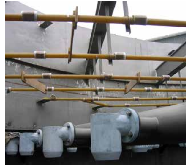
🕒 M.E. Wash Pipes