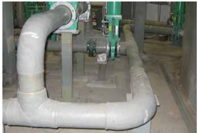
HPPE A-150 in service as FGD process pipe at a US power utility.