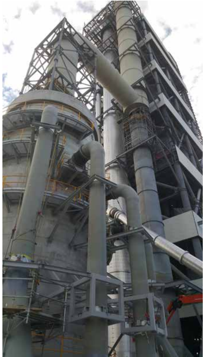
HPPE A-150 in service in a flue gas desulfurization process.

For recommendations on accommodating thermal expansion, refer to RPS Design Manual . For information on conducting a pipe stress analysis of A-150 piping, refer to RPS Doc. No. E--433 , available from our Engineering Department.