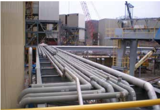
HPPE A-150 in service as CCR piping at a US power utility.