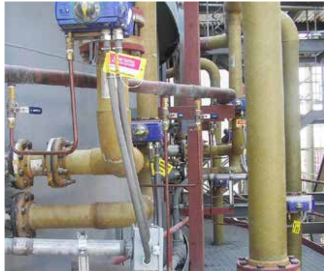
HPPE P-150 in service at a chemical processing plant.