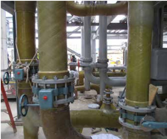
HPPE P-150 in service in a cooling water unit.