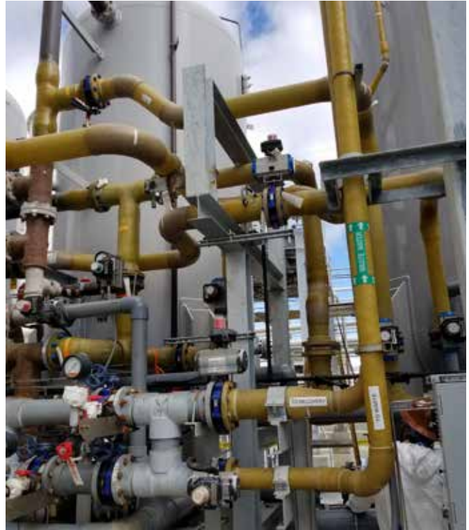
HPPE P-150 in service at an acid recovery plant.

For recommendations on accommodating thermal expansion, refer to RPS Design Manual . For information on conducting a pipe stress analysis of P-150 piping, refer to RPS Doc. No. E--433 , available from our Engineering Department.